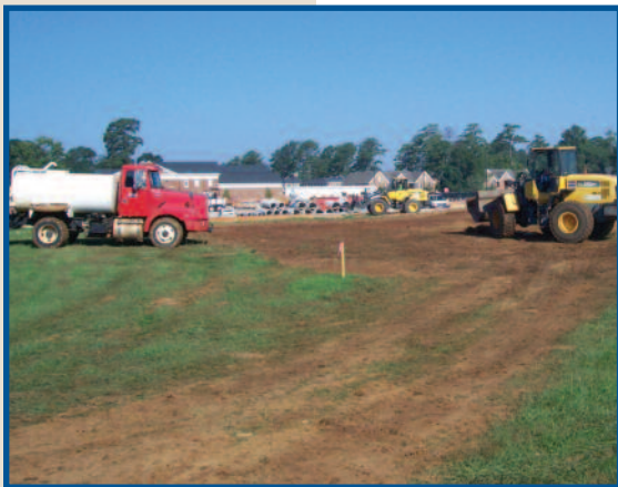
The future home of Iota Iota Chapter on University Boulevard.

If you have an opportunity to return to Tuscaloosa this fall, you will notice some new construction along University Boulevard near the new Pike house. More information will be forthcoming over the next several months, but we want to share the outstanding news that the University Board of Trustees has approved of Iota Iota's plans to build a new chapter house on University Boulevard! The House Corporation and alumni volunteers will be reaching out to our brothers over the next academic year as plans and details are still being finalized, but we don't want anyone to be surprised this fall if they notice the lot being prepared for construction on campus. This is a tremendous step for the future of Iota Iota and, with alumni