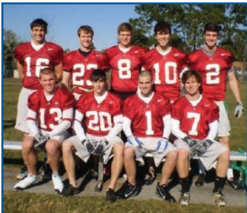
The champion flag football team.

At the start of the spring semester, Iota Iota was leading all fraternities for the Crimson Cup intramural sports championship. This was largely due to the success of the Iota Iota flag football team, who won the all-campus championship in the fall. Winning the championship had not been accomplished by a fraternity team in a very long time. Our team clinched a bid to the National Flag Football Championships in Orlando, where we finished fifth in our division.