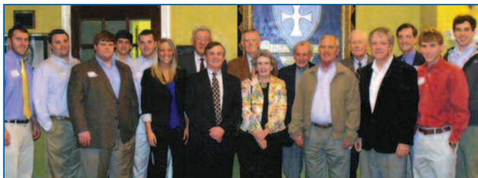
The chapter honored three Iota Iota WWII veterans at a special dinner in March.