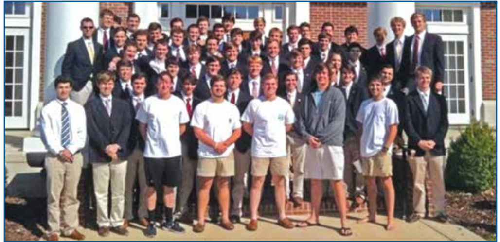
The fall 2012 executive board with the fall 2012 pledge class.

Last fall, we were excited to host hundreds of alumni and their families for the grand opening of the new chapter house, and we look forward to continue welcoming alumni and friends into our new home this year. We're deeply grateful to our alumni and the members of the housing corporation who made our move back to University Boulevard