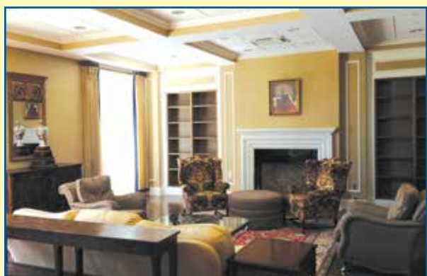
The formal room of the new Iota Iota chapter house.