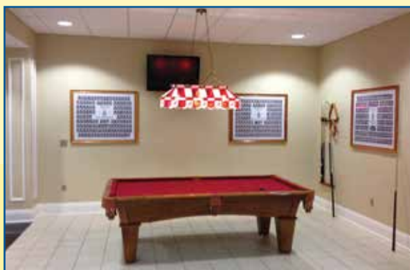
Brothers come here to unwind with a game of pool.