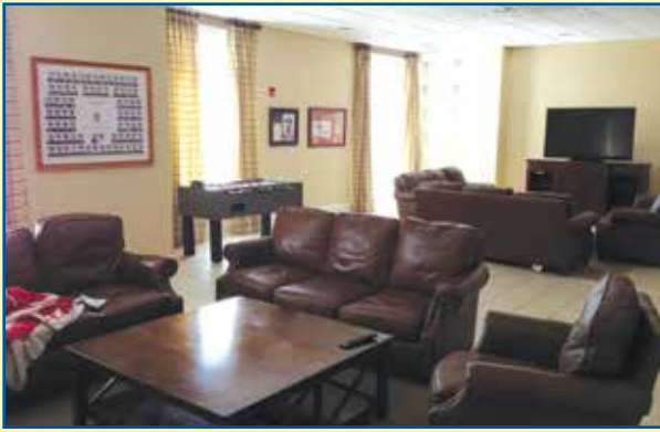
Brothers can relax and watch TV in the common room.