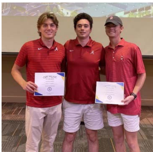
Executive members receive awards for fundraising part of Sigma Chi's $3.6 million raised for the Huntsman Cancer Foundation.

We can't wait to see what the rest of the academic year will bring after taking a rest during the holiday season!