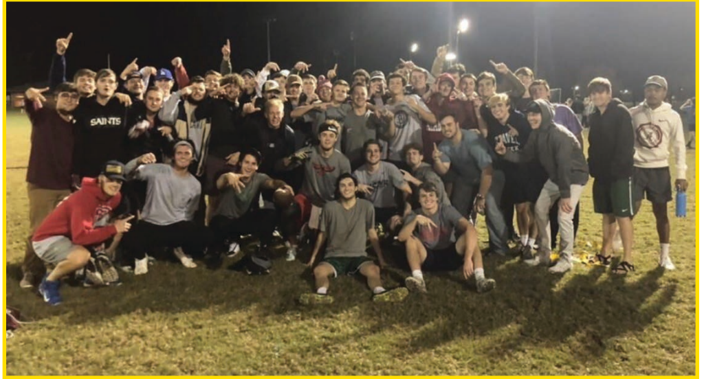
Congratulations to our intramural flag football team for winning the league championship!