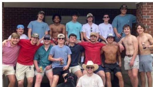
Brothers hanging out in front of the house.

Continue to promote our newly formed mental health and wellness committee that focuses on the mental health and overall individual development of our members to support them through the ups and downs of life as college students.